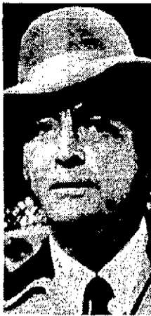
Dean Martin 'Red Hot Scandals'

8-9 (Channel 5) — Six American Families is a fascinating documentary series focusing on six households across the country, reflecting in microcosm the strengths and tensions in family life. The opener features "The Paschiak Family